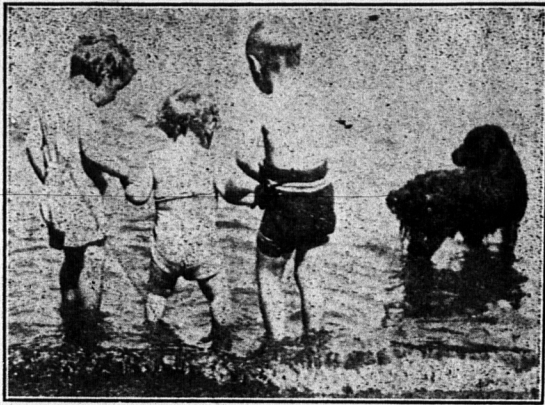
"When Shall we Three Meet A. ain."

Some of us fail never forget the beautiful, and impressive scene of twelve hundred well behaved boys and girls assembled in Market Hall week. We wonder how you have spent your holidays and how much