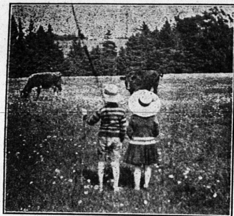
"There are so many echoes in the world, so few are I."

He has achieved success who has lived well, laughed often and loved much; who has enjoyed the trust of pure women, the respect of intelligent men, the love of little children; who has filled his niche and accomplished his task; who has left the world better than he found it.