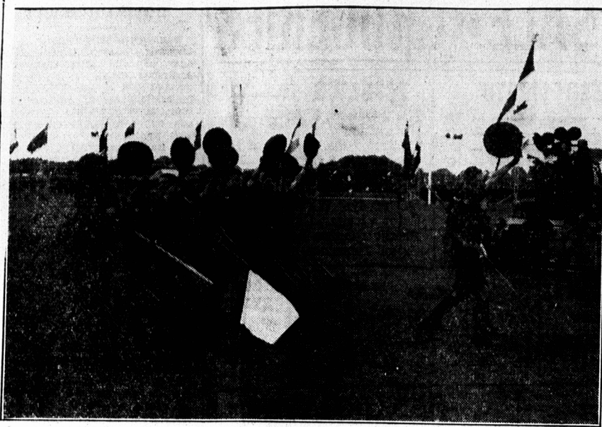
The Canadian Boy Scouts were accorded the honour and distinction of leading in the grand March past the Chief Scout, Lord Baden-Powell and the Queen of Holland at the Jamboree. Readers will be able to recognize the three Island Scouts in this picture.