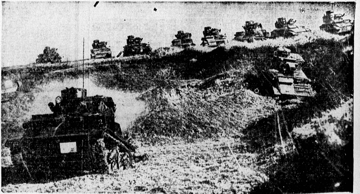
Surpassing in ferocity and terror anything which might be imagined was the terrific battle which took place May 13th when an estimated 2,000 tanks—land battleships—met in head-on conflict in the heart of Belgium.