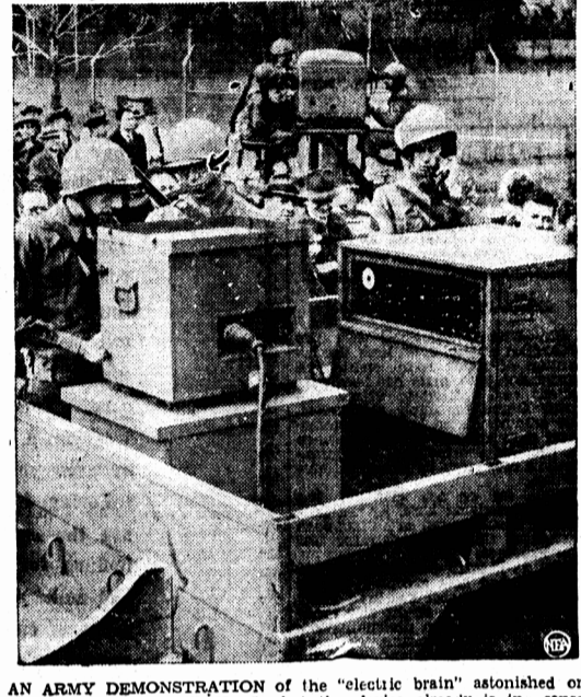
AN ARMY DEMONSTRATION of the "electric brain" astonished on-lookers at Murray Hill, N. J. but the device already is in sensationally effective action against our enemies.

Repatriates Tell Of Treatment In Japanese Camps WASHINGTON, Dec. 3 - (AP) - American inventiveness has whittled down to the status of just another warship that once was a very real and present dread - fire on aircraft carriers.