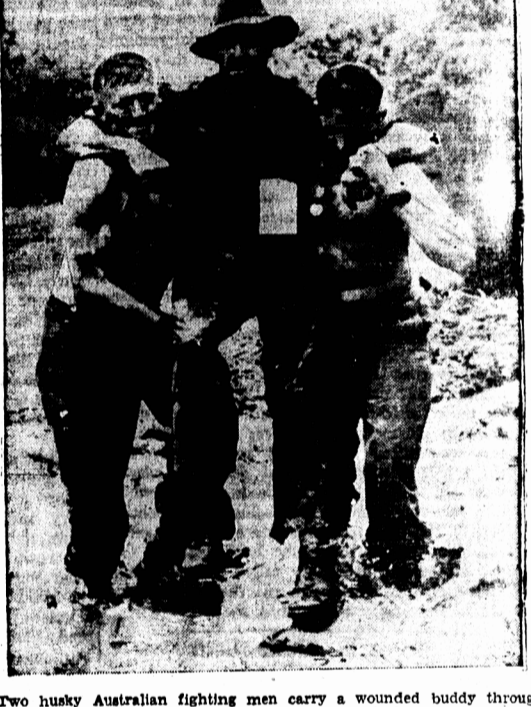
Two husky Australian fighting men carry a wounded buddy through mud and slush of New Guinea to advanced medical station near Lae.

PREDICTS NAZI MURDERS BLACKPOOL, England - (CP) - Hitler was described here by Lord Vansittart, former permanent advisor to the foreign office, as a "bloodthirsty Donald Duck".