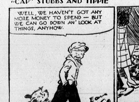
WELL, WE HAVEN'T GOT ANY MORE MONEY TO SPEND — BUT WE CAN GO DOWN AN' LOOK AT THINGS, ANYHOW.