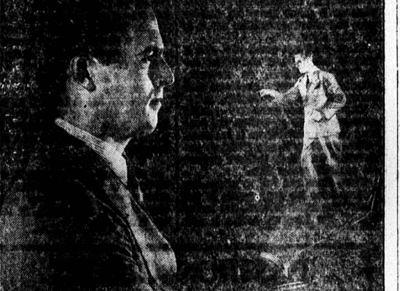
Have a heart-to-heart talk with yourself! Double exposure, accurately planned, will let you.

DO you remember the wonder tales you read when a child, the forbidding castles filled with ogres, the huge jinn of the Arabian Nights, the trolls that lived under bridges and the fairies that haunted mysterious woodlands?