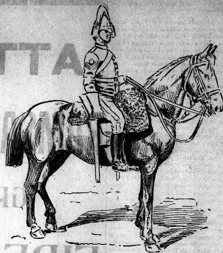
SERGEANT, INNISKILLING DRAGOONS.