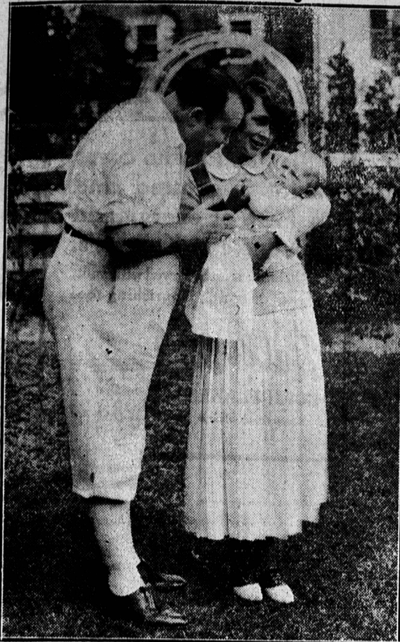
A HAPPY FAMILY