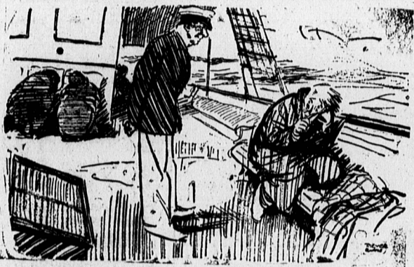
Captain: "You seem to be taking it pretty badly." Passenger: "Yes, confound you, why can't you alter your wavelength?" —London Opinion.