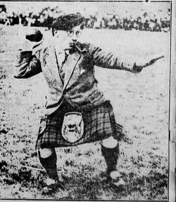
SIR HARRY LAUDER PUTTING THE SHOT The Cowal Highland gathering was attended by Scottish people from all parts of the world. There is a lot of pep in Sir Harry Lauder yet, as is evidenced by his vigorous windup before putting the shot.