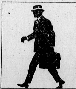
Inhale and Exhale with left Foot Forward.

MANY people take breaths that are too short, while those who have deliberately set themselves to breathing by rule, without proper instructions, are very apt to breathe too deeply. I have known some who acquired the habit of lower diaphragm breathing. This presses the stomach out and down and has a tendency to narrow the chest. People who get little exercise are very apt to take short breaths.