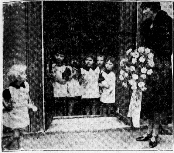
Princess Mary is here seen talking to some of the homeless little ones who will be looked after at the Wright Kingsford Home at North Finchey, England.