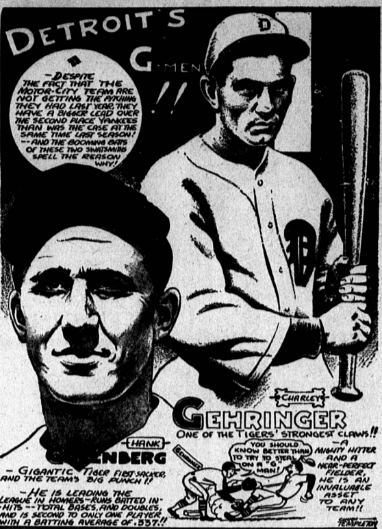
Gehringer ONE OF THE TIGERS' STRONGEST CLAWS!!

(A. P. By Guardian's Special Wire) Hank Greenberg, the Tigers' slugging first baseman, and Joe Medwick, the Cardinals' hard hitting outfielder, closed in a little yesterday on their rivals as they showed the only gains among baseball's big six. Greenberg pounded out two hits in three times at bat, including his 31st homer, to boost his average to .344, a gain of two points. Medwick gained one point and advanced to .379 with two hits in four times at bat. At the same time the league leaders, Joe Vosmik in the American and Arky Vaughan in the National, lost one point each.