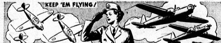
KEEP 'EM FLYING!