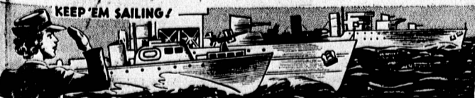
KEEP 'EM SAILING!