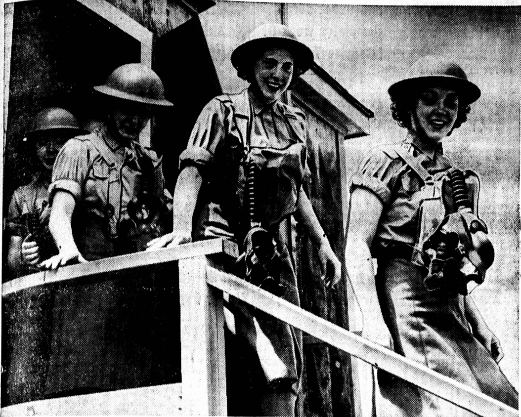
Canada's three women's services, C.W.A.C., WRENS, and the Air Force Women's Division are calling for recruits to replace men for overseas combat duty.