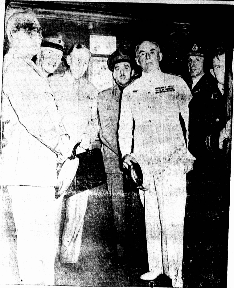
QUEBEC.—Top flight officers of the United States and Great Britain take a Chateau Frontenac elevator to the conference floor. Left to right, General H. H. Arnold, chief of the U. S. Army Air Corps, Field Marshal Sir John Dill, head of the Joint Staff Mission in Washington; General George C. Marshall, chief of staff of the U. S. Army; General Sir Alan Brooks, chief of the Imperial Army General Staff; Admiral Sir Dudley Pound, First Sea Lord and Air Marshal Sir Charles Portal, Britain's chief of staff for air.