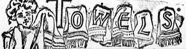
Table linens Napkins, Blankets, Comforts, etc. Great Bargains in these Goods

This ad tells about some of the bargains. Read it. It will repay you to investigate