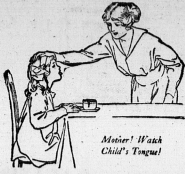
Moither! Watch Child's Tongue!

for Sore Throat, Tonsillitis, Quinsy, Colds, Coughs, Whooping Cough, At Druggists