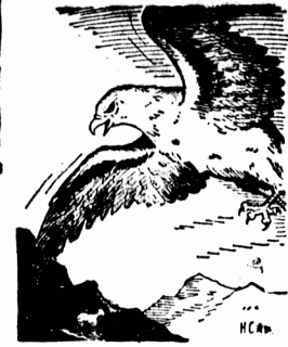
On a high, rocky point she saw a spot of white.

It was the time of babies with many who lived on and among the High Mountains and with others who lived on the Great Prairie. In woodland retreats were baby Deer, called fawns, and Elk babies and Moose babies. These are always called calves. Out on the Great Prairie were baby Antelopes. These are called kids, as are all Goat babies. It was the