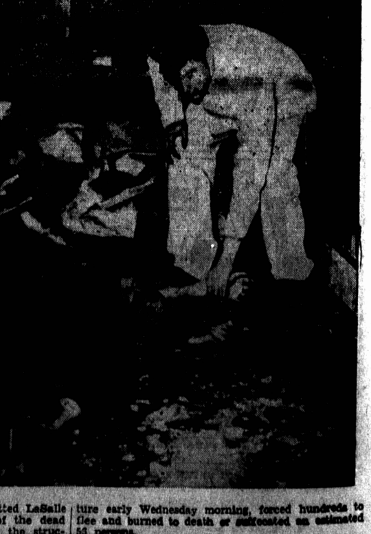
In the charred ruins of the fire-gutted LaSalle, late Wednesday morning, forced hundreds to flee, Chicago, doctors examine some of the dead (see and burned to death or suffocated as estimated and injured. Flames, sweeping through the structure, 56 persons.