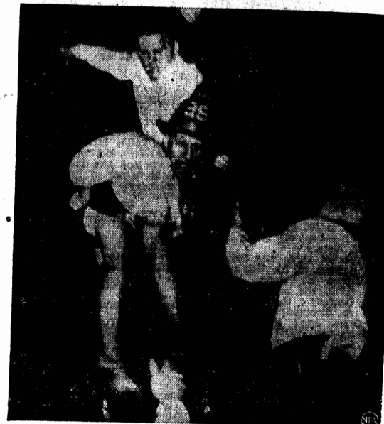
A Chicago fireman carries a LaSalle hotel guest to safety after the structure was overcome by smoke. Fire early Wednesday morning swept through the structure leaving an estimated 56 persons dead and hundreds of others injured.