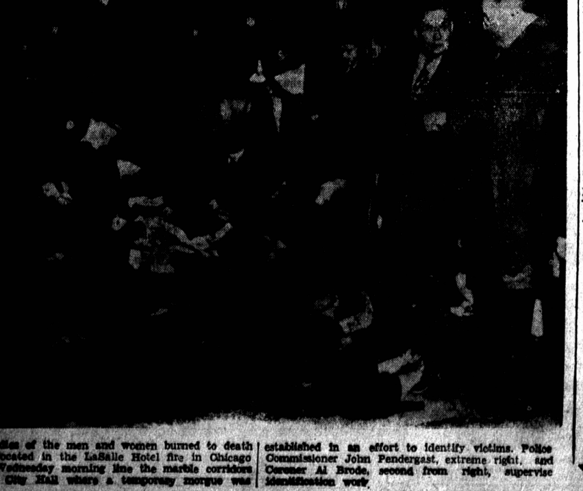
Bodies of the men and women burned to death at the LaSalle Hotel fire in Chicago Wednesday morning line the marble corridors of the City Hall where a temporary morgue was established in an effort to identify victims. Police Commissioner John Pendergast, extreme right, and Councilman Al Brode, second from right, supervise identification work.