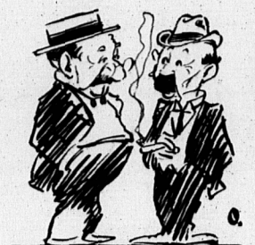
FLOATING "Our city has quite a floating population." "Where do you live, at the seashore or where there are no prohibition agents?"