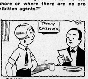
COMBINATION UNKNOWN Waitress: We got fine pork today— Youthful Diner: Applesauce? Waitress: Don't get gay, young man! Don't yer want nothin' to eat?