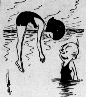
He: Aren't you afraid your suit will shrink when you get it wet? She: No, I made 'em guarantee that it would shrink, before I bought it.

ROCKY POINT FERRY TIME TABLE Commencing June 1st, the Steamer Hibernia will run between Charlottetown and Rocky Point during the summer months, as follows: