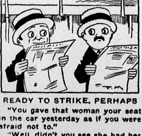
READY TO STRIKE, PERHAPS "You gave that woman your seat in the car yesterday as if you were afraid not to." "Well, didn't you see she had her hand over her head with a strap in it?"