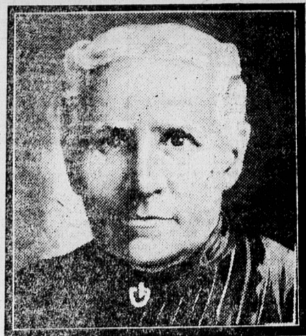
GRANDE LIGNE, QUE., JAN. 2nd, 1910.

"I heartily recommend 'Fruit-a-tives' to all who suffer from Constipation and the painful consequences—Piles. I am now over 80 years of age and suffered for over 20 years with Constipation and Piles. I tried all kinds of remedies, saw the doctors and took their medicines, but nothing cured me. About four years ago, I received a sample of 'Fruit-a-tives.' After taking a few boxes, I really felt that 'Fruit-a-tives' were doing me good. As 'Fruit-a-tives' were not sold here I wrote to Ottawa for several boxes. My previous opinion of the value of 'Fruit-a-tives' was more than confirmed by the wonderful good they did me. After taking four boxes, I felt well—my bowels were regular—and the Piles had disappeared. My wife was troubled for three years with Asthma and Eczema on the hands, which made her hands almost useless. The doctor gave her several ointments to use, none of which had any effect. He also advised her to use rubber gloves (she wore out three pairs). I persuaded her, as a last resort, to try 'Fruit-a-tives.' The effect was marvelous. Her hands are cured and the Asthma has also left her. We both attribute our present good health to 'Fruit-a-tives.'"