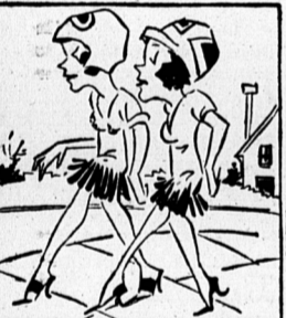
"The bride wasn't a bit self-possessed."

"How could she be when her father was standing there just waiting to give her away."