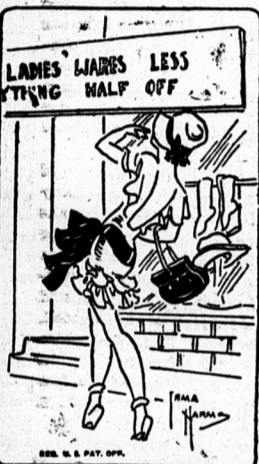
"Some advertisements are truthful though the grammar is faulty."