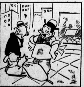
"You think the German language is regular street talk, eh?" "Yes, so guttural."

AN AUTUMN WIZARD King Midas is no myth, I hold, But walks the earth, a wizard bold. Last night my maple's leaves were green As in yon viney screen. And now each one is turned to gold! King Midas is no myth, I hold.