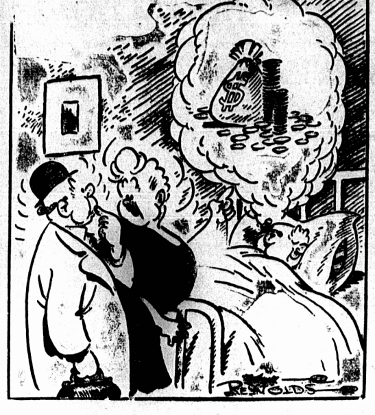
"See what I mean, Doctor, night after night he dreams about Guardian Want Ads!"