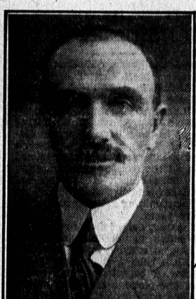
HON. W. M. LEA Provincial Secretary-Treasurer and Minister of Agriculture