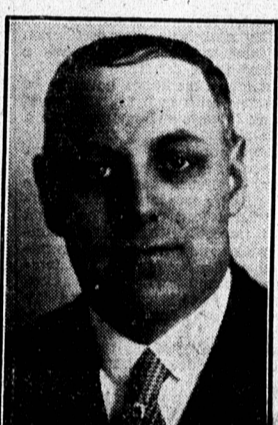
HON. T. W. L. PROWSE Minister Without Portfolio