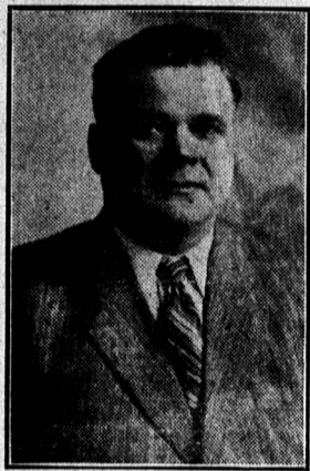
HON. JAMES P. MCINTYRE Minister of Public Works