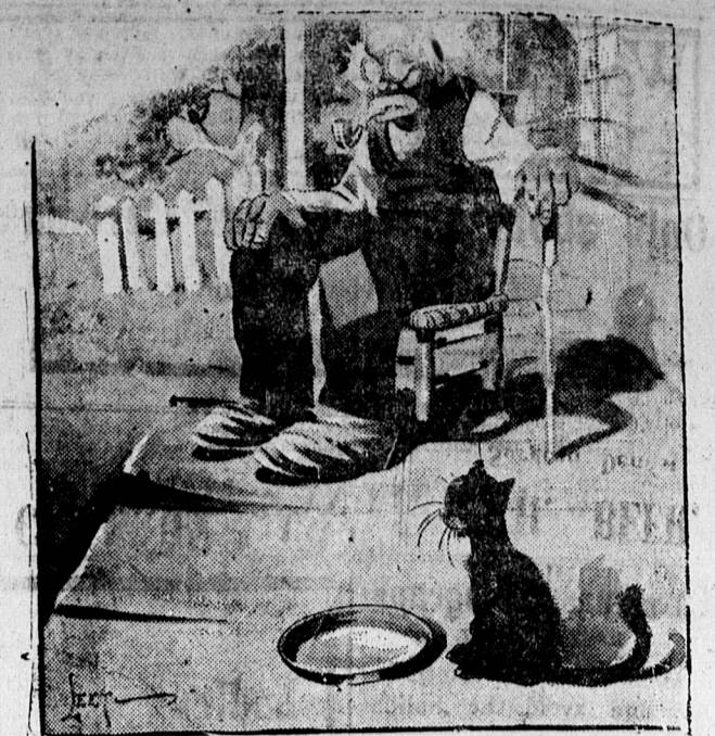
Uncle Persimmons: De fair sex am growin' lazier an' wulfless ebery day. Heah's de ole woman gone out to hoe to cohn an' let me without matches—an' now I gotta go in an' git some out'n de kitchen mahself!