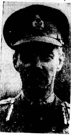
Lt. Gen. Christopher Demsey, above, commands the British Second Army making the drive upon France. In Normandy, General Demsey commanded a brigade in France and Belgium before fall of Sicily. Later participated in Sicilian and Italian campaigns.

Excess acids, poisons and wastes in your blood are removed chiefly by your kidneys. Letting up nights, burning, nervousness, rheumatic pains, frequent headaches, and feeling worn out often are caused by kidney and bladder troubles. Usually in such cases the very first dose of Cyston goes right to work helping the kidneys clean out the acids and poisons. Cyston goes right to work helping the kidneys clean out the acids and poisons. Cyston goes right to work helping the kidneys clean out the acids and poisons.