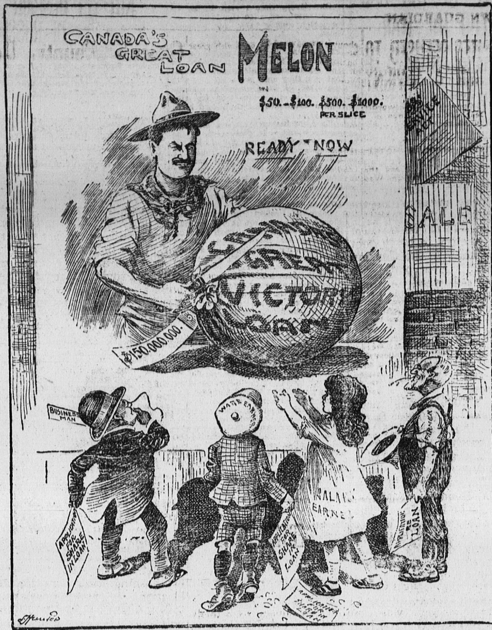
All want a slice.