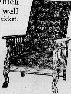
$5.00 to $20.00