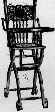
$1.00 to $4.75

Elegant hand drawn, and Battenberg linens. Ideal gifts to send to friends abroad—mailing costs but a trifle and the articles can't break in transit. These are real hand-made goods such as every woman delights to possess.