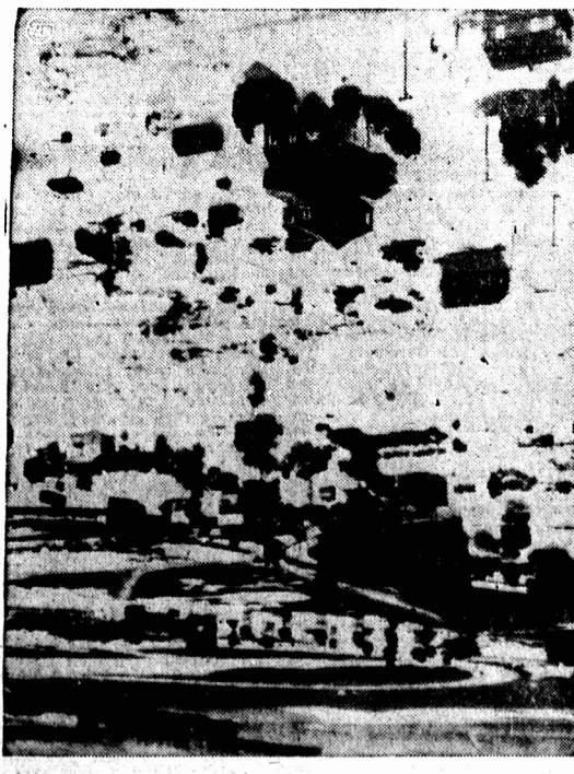
Record rains sent a flash flood scurrying over a section of the highway between East St. Louis, Ill., and Collinsville, inundating farms and buildings. More than 2,000 families in the St. Louis area were left homeless and two persons were reported drowned. August rainfall was so heavy it broke a 100-year record.