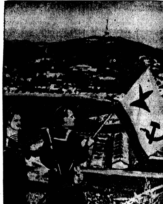
Russian airborne forces on Aug. 23, 1945, occupied Port Arthur in Manchuria, avenging after 40 years the Japanese attack on that naval center in the Russian-Japanese war, when Russia lost the port to Japan. The Soviets also occupied Dairen, and the entire Japanese Fifth Kwantung Army Group surrendered. On that day, too, General MacArthur sent instructions to Tokyo in preparation for Allied occupation.