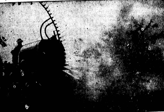
Lucien Fontaine's homemade 20-nozzle spray gun seen in action at the Rougemont, Que., orchard. The gun is operated by a wheel near the driver's seat which directs the spray up or down, forward or backwards.