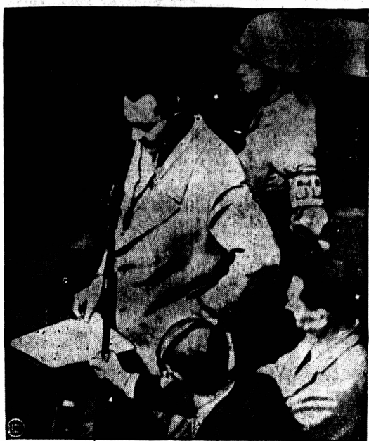
Reichsmarschall Hermann Goering protests his innocence in a last minute plea before the International Military Tribunal at Nuernberg, Germany. Goering was the first of 20 co-defendants to speak before the tribunal begins to weigh evidence.