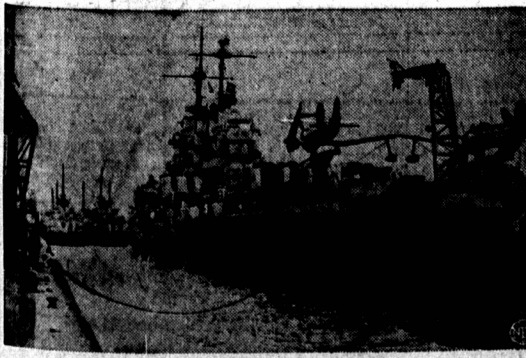
Pictured tied up at a Lisbon, Portugal, dock is the USS Little Rock, one of the group of U. S. warships participating in combined Mediterranean training cruise and good-will visit to Greek ports. Moscow saw significance in fact the visit coincided with USSR's demand for a hand in control of Dardanelles.