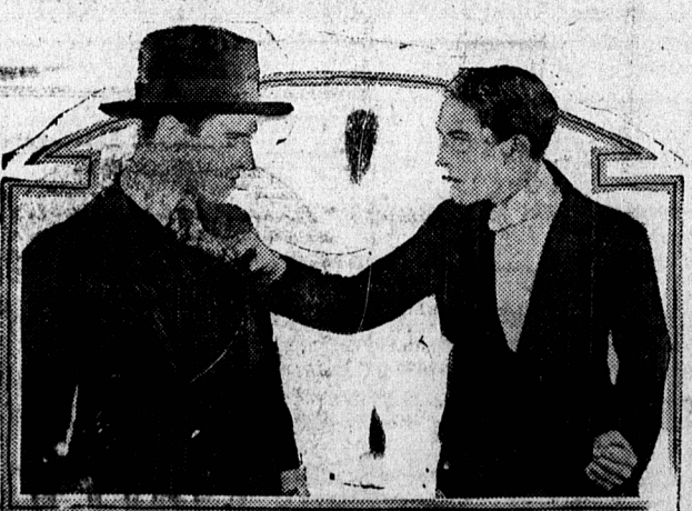
JACK PICKFORD in "SANDY" A Paramount Picture

The Popular Young Star Jack Pickford IN—"SANDY"