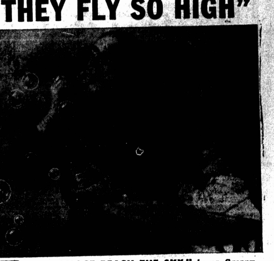
"THEY FLY SO HIGH" ... THEY ALMOST REACH THE SKY," hums Granny, between bubbles. She knows all about amusing babies! Knows about corn flakes, too.