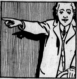
OUNDING THE PRAISES

"I have been bothered with Rheumatism for the past year and have taken a good many kinds of medicine, but found no relief. A friend advised me to try GIN PILLS and after taking a few boxes, I felt like a new man. I want the relief they gave me and would advise all sufferers to take GIN PILLS!"