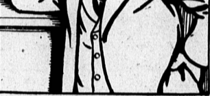
COULD NOT WORK

These written words and signed statements from well-known people are the best possible guarantee of the value of GIN PILLS. They prove that GIN PILLS will give prompt relief—and will completely cure—every trace of Rheumatism, Sciatica, Lumbago, Pain In The Back, Kidney Trouble or any weakness of the kidneys or bladder. You may try GIN PILLS before you buy them. Write us for free sample box. If you can't get the regular size boxes in your neighborhood, send to us enclosing the regular retail price of 50c. a box or 6 for $2.50. National Drug and Chemical Co. of Canada Limited, Dept. C. E., Toronto, 62