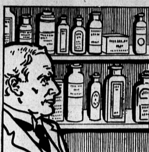
MANY KINDS OF MEDICINE

Rheumatism is a dreadful disease. Only those, who have had it, can appreciate the agonizing pain—the excruciating torture—that racks the body when Rheumatism sets in. No wonder those, who have been cured of Rheumatism by GIN PILLS, are so grateful and so enthusiastic. They gladly testify that GIN PILLS cured them and want all the world to try GIN PILLS.