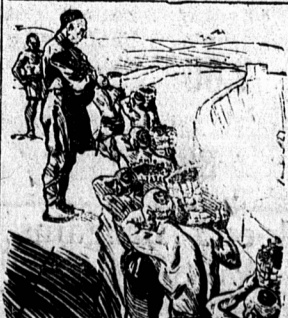
The building of the Great Wall is an important event in Chinese history.

THE CHINESE YEAR What year do you suppose it is in China? "The same year it is here," you may reply—and that is correct in one way. Our old earth has been traveling around the sun for a certain number of years—many millions, scientists say—and the number is the same whether we live in China or in North America.