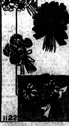
DESIGN NO. 1122 For get-into-nots, wild roses and daisies are colorful flowers. Easy to crochet and lovely to wear in the bath, mountaineers or hat trimming.