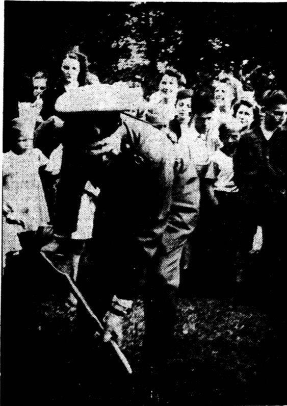
PLANTING AN OAK—Viscount Alexander planting an English oak sapling at the Experimental Farm. "If it doesn't grow satisfactorily," he said, "I shall come again and plant another."