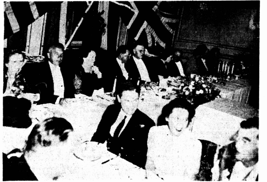
HEAD TABLE—Guests at the dinner headed by the Provincial Government for Their Excellencies at "The Charlottetown."