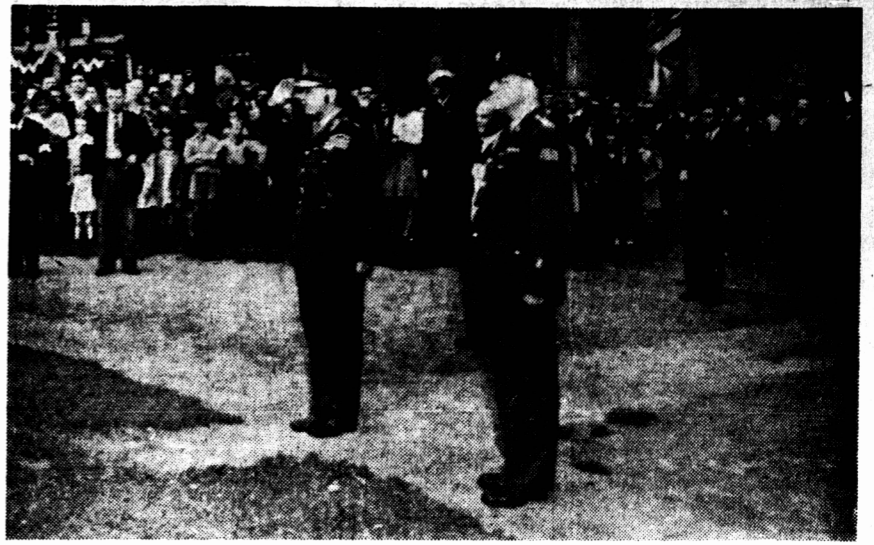
AT WAR MONUMENT—The Governor General placing a wreath at the base of the war monument, saluting in honour of the hallowed dead, after