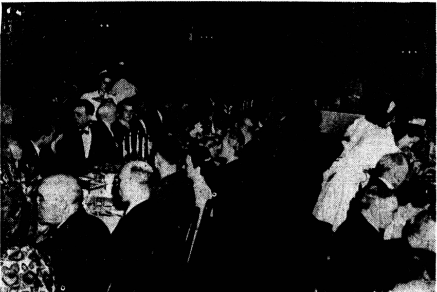
AT THE DINNER—A group of seated guests pictured at the dinner given in honour of Their Excellencies at "The Charlottetown."