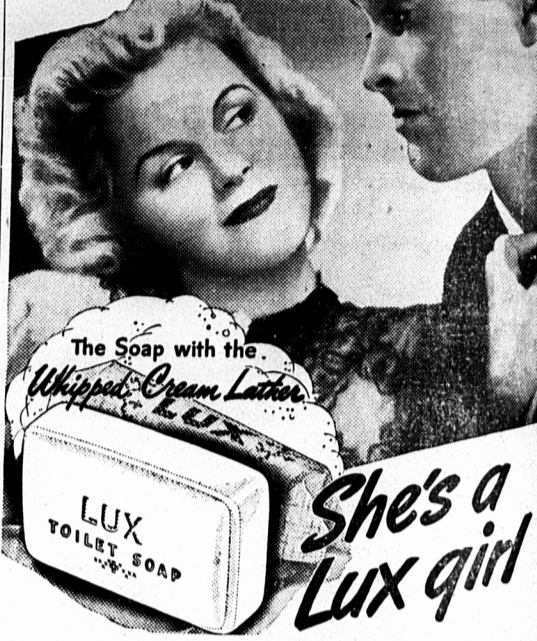
The Soap with the Whipped Cream Lather

Steel sheets are "pickled" by immersion in acid in order to well the scale, or iron oxide, formed during the hot-rolling of the sheets.