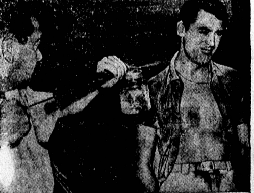
GARY GRANT, on the set of "Destination Tokyo" submits to the spray-gun in the hands of a make-up man, for the sake of realism. Cloaked in secrecy by the Navy, this Warner Bros. set is practically a military secret. Others in the cast of this submarine thriller are John Garfield, Alan Hale and John Ridgely.