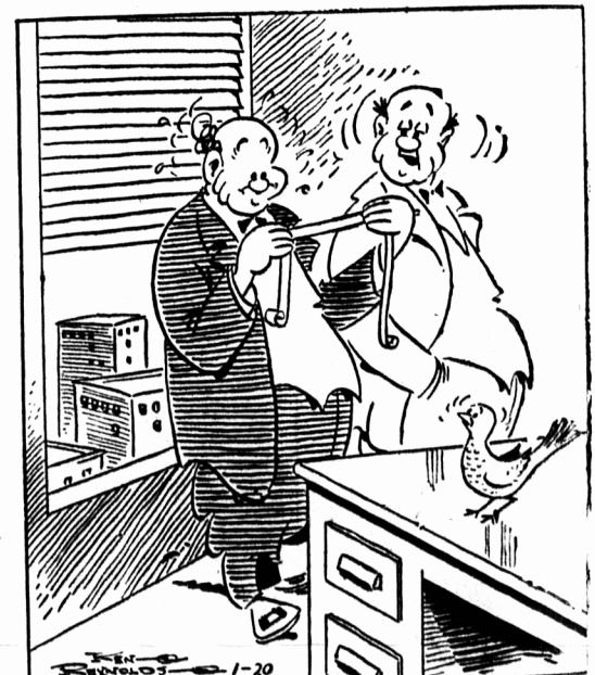
"That carrier pigeon must have made a mistake—we haven't used any Guardian Want Ads lately, have we?"