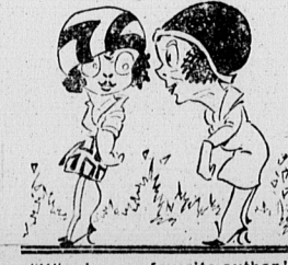
"Who is your favorite author?" "What do you mean? The one whose pieces I like to read or the one whose picture looks cutest in the advertisement?"