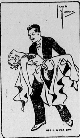
"A chronic fainter, like a good resolution, is seldom carried out."

THE STAY AT HOME Let others go and suffocate in chambers six by nine. These torrid nights a hammock strung upon the roof is fine. While broiling on a sandy beach some foolish folks may please, I much prefer with book and pipe at home to take my ease.