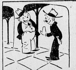
"Well, so long, Cook, where are you going to spend your vacation?" "Going to spend my vacation money at the seashore, and the rest of my vacation at home."

THE STAY AT HOME Let others go and suffocate in chambers six by nine. These torrid nights a hammock strung upon the roof is fine. While broiling on a sandy beach some foolish folks may please, I much prefer with book and pipe at home to take my ease.