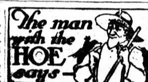
The man with the HOE says—

The British Minister of Health has promulgated a number of regulations effective after the end of this year, restricting the importation into the United Kingdom of