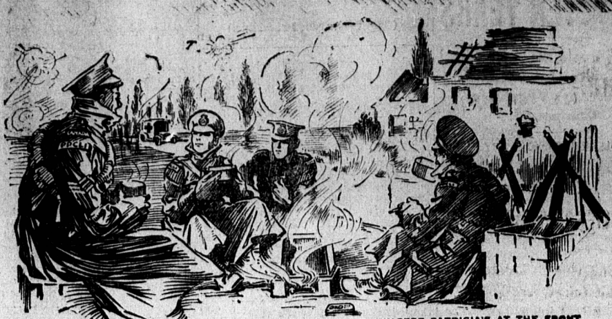
PRINCESS PATRICIA'S AT THE FRONT