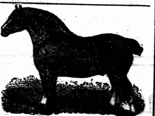
CROWN RIGHTS, McKinnley Bros.—2nd prize.