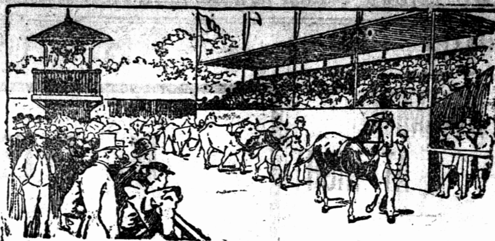
THE HORSES AND OTHER STOCK SHOWN.