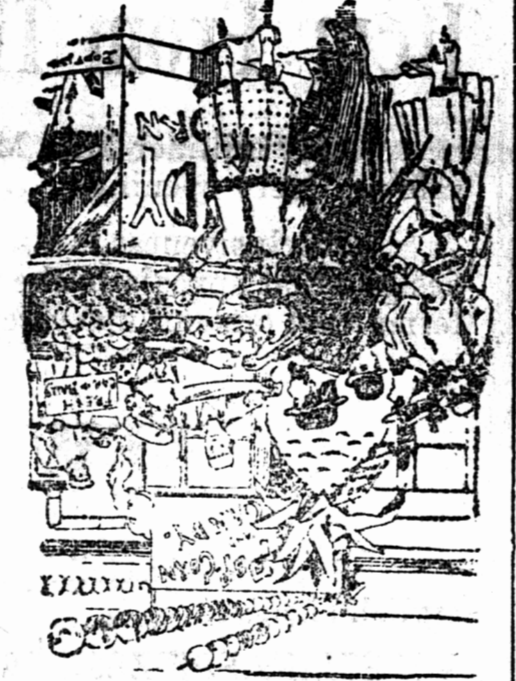
A CORNER OF THE BUILDING.