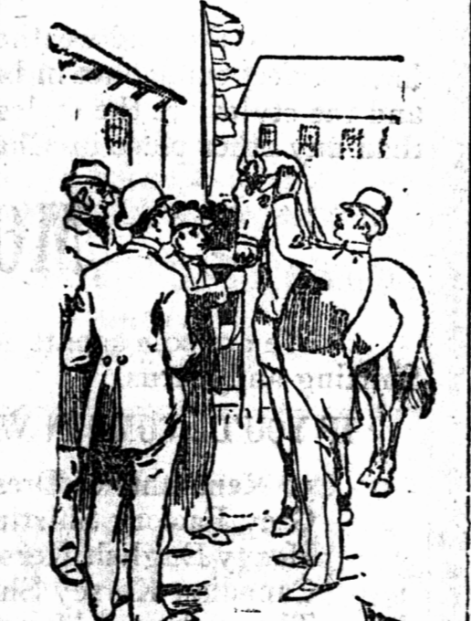
JUDGING THE HORSES.