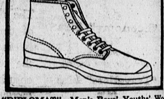
"DIPLOMAT"—Men's, Boys', Youths', Women's, Misses' and Children's sizes. Balmorals and Oxfords. Re-ly-on sole.

SHOES good enough for an athlete are not too good for every one of us. The athlete realizes that sound, well developed feet are vital to success, and so he wears Fleet Foot. Fleet Foot Shoes contribute to well developed feet and ankles. They give comfortable support without restraint, and allow the foot muscles to function normally. Fleet Foot Shoes stand more hard wear and rough usage than you would believe possible from any shoe.