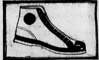
"RUNNER"—Tan fabric, blucher bal, lace-toe. Men's, Boys' and Youths' sizes. Re-ly-on sole.