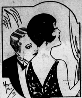
BUT SELDOM DESERVES THE FARE

She: Don't you think none but the brave deserves the fair? He: Perhaps, but he seldom deserves the fare he gets after he marries her.