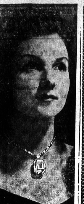
Brenda Frazier, who rates as a million-dollar glamor girl, "models" the famed $1,000,000, 125-carat Jonker diamond at a New York jewelry fashion show.