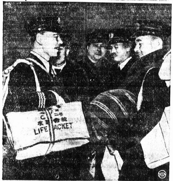
Happy smiles wreath the faces of these Japanese officers as, still carrying their life preservers, they gather in a London hotel. They were among 299 persons rescued from liner Terekuni Maru, sunk by a mine off Harwich, England.

"BOY MEETS JOY" — Comedy — Looneytoon Cartoon VINCENT LOPEZ and HIS ORCHESTRA