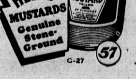
HEINZ MUSTARDS Genuine Stone-Grind 57