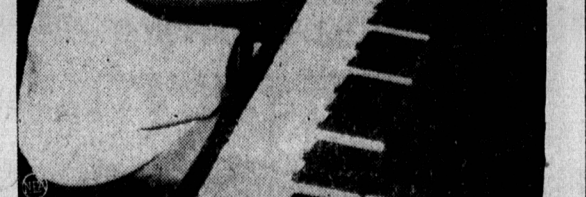
Blind, 21-months-old Gary Trent of Freelandville, Ind., runs through a melody on the piano. He started his playing four months

A Cleaner A cleaner for wall paper can be made by mixing two cups of flour and one tablespoonful of kerosene with enough water to make a stiff dough; then knead thoroughly. Use like ordinary cleaner.