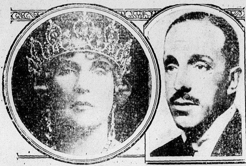
Above are shown King Alfonso and Queen Victoria of Spain, whose throne is jeopardized by bursting into flame of a general revolutionary movement, which has thrown their country into turmoil. Two revolutionary leaders were reported shot yesterday, while general strikes have terrorized sections of the country, with aeroplanes dropping pamphlets in Madrid in the name of "the army and the people." King Alfonso is said to have declared that he would prefer death to abdication.