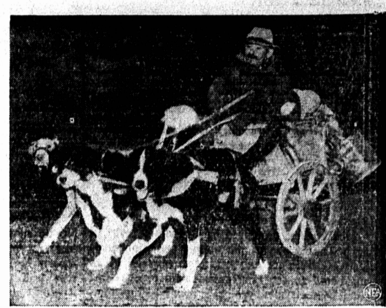
In Rome, gasoline is so high-priced that this junk dealer switched to dog-powered transportation. To meet regulations, he had to fit a hand brake to his cart. It works fine—as long as no cats come along.

What a treasure-house of memories this fine old gentleman must possess! What joys and sorrows mark the passing of 98 years! And now at the going down of life's sun, may he be able to enjoy the fruits of a long life well spent in the service of his country and his God.