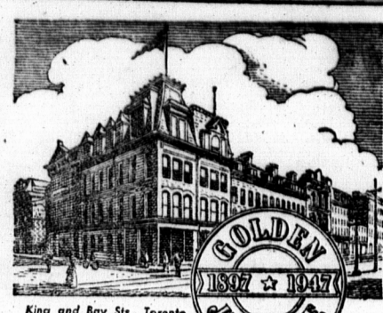
King and Bay Sts., Toronto, in 1897 — that's when Grape-Nuts was born!

Potential Enrollment "In the discussion which followed, it was suggested that the Department of Education might be consulted for the actual and potential high school enrollment, and in the matter of high school