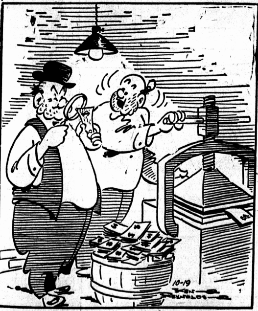
"Say, have we got competition?—I hear dem Guardian Want Ads is makin' money too!"