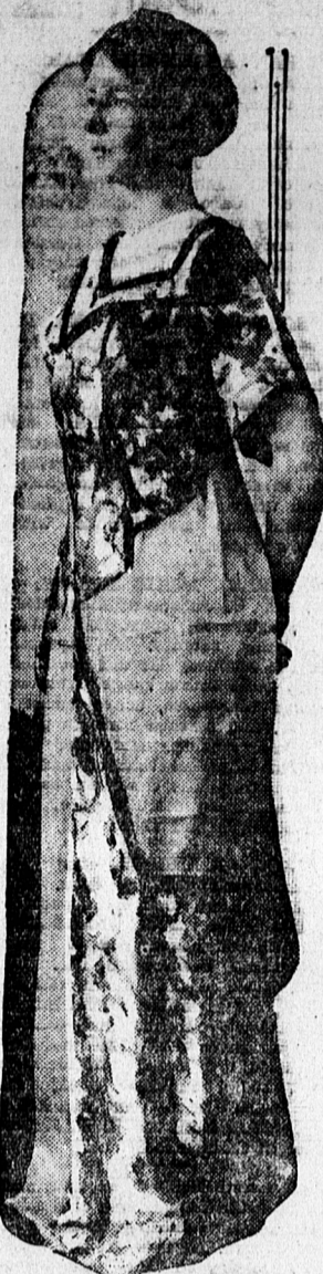
The "Cubist" Frock

For more than three centuries, counting from the invention of gunpowder and the use of firearms, the bullets used in army weapons remained similar in form and composition to those used for sporting game; that is, they were round, and formed entirely of lead. Although the old spherical leaden bullet was the most ill-conceived and defective that could be imagined, it was only toward the second half of the last century that efforts were made to change the form. At first the diameter of the bullet was reduced, owing to the fact that the resistance of the air increases in proportion to the diameter of the projectile, but as it was necessary, nevertheless, to retain a sufficient weight, the power of wounding being in proportion to the projectile's mass, they were lengthened at the same time. Thus, instead of a sphere the bullet took the form of a cylinder, except the inferior portion, which gradually was made more pointed.