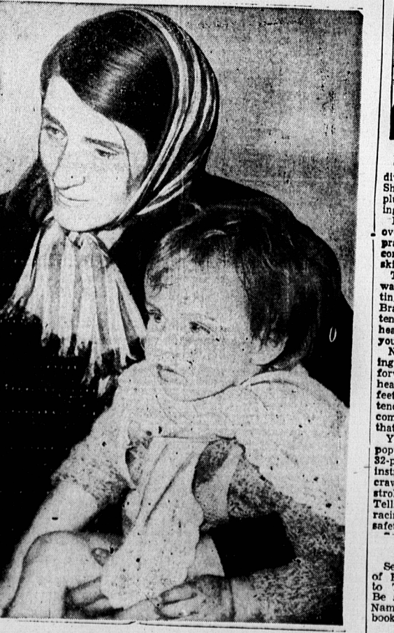
Portraying the tragedy of refugees driven from their native lands to seek shelter from enemy terror, this photograph has all the qualities of an oil painting.