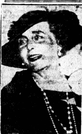
REPORTED SERIOUSLY ILL

Dowager Queen Marie of Roumania, granddaughter of Queen Victoria, who is reported seriously ill of an intestinal disorder and partial paralysis. Queen Marie, 61, one of Europe's most colorful royal figures, has been ill for several days. Officially, it was said, she was suffering from "mild auto-intoxication," while unofficial quarters believed it was ptomaine poisoning.