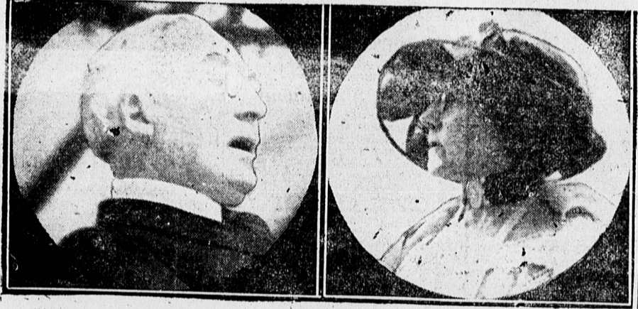
WARREN G. HARDING, president of the United States, and Mrs. Harding photographed during their visit to Vancouver a few days before the president was stricken by his serious illness.